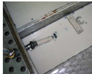
MOT-suction float for higher amount of floating chips