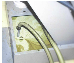
Pipe float for very small openings in the cover of tanks