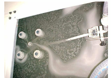
Suction float for large emulsion tanks